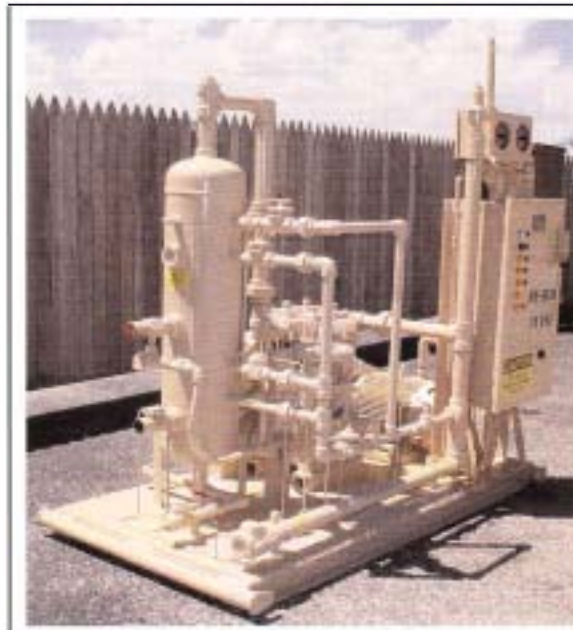
Rotary vane, rotary screw, reciprocating and liquid ring compressors can all be used in casinghead pressure reduction applications. Each has relative advantages and drawbacks. Small reciprocating compressors like the one shown here can be cost-effective alternatives for remote wells, but are only recommended for dry gas streams.

Rotary screw compressors are generally the most versatile technical solution for capturing wet or dry gas streams on daily volumes of 300 Mcf to 5 MMcf. Rotary screws can pull a significant vacuum and can handle discharge pressures up to 350 psi. In addition to handling wet gas, they also can handle the liquid slugs that often accompany casinghead gas. Versatility comes with a cost, however, as these packages are generally the most expensive of the four compressor types.