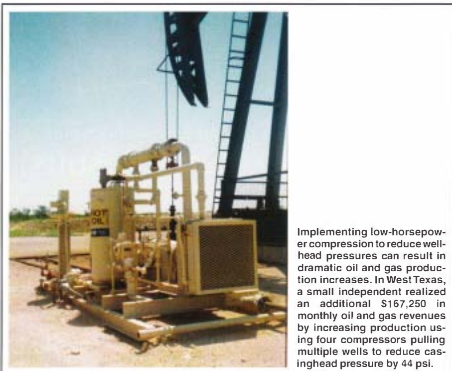
Implementing low-horsepower compression to reduce wellhead pressures can result in dramatic oil and gas production increases. In West Texas, a small independent realized an additional $167,250 in monthly oil and gas revenues by increasing production using four compressors pulling multiple wells to reduce casinghead pressure by 44 psi.

In another application last year in Coleman County, Tx., a large independent reduced casinghead pressure from 25 to 1