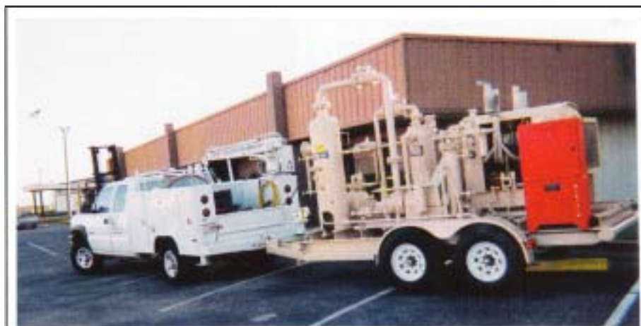
A structured test approach is used to evaluate the estimated production curve of the well or formation following the reduction of casinghead pressure. This includes determining the volume of casinghead gas produced, analyzing the gas, and conducting a 30-45 day test using a portable trailer- or skid-mounted package.

If the well responds appropriately, an electric-drive unit can be moved to location to replace the test unit. Electric-drive packages have dramatically less maintenance issues and do not consume $5/Mcf gas. If wells are located in close proximity to one another, opportunities may exist to link multiple wells to the same compressor. The key is distance, keeping in mind that the goal is to maintain each wellhead to as close to 0 psi as possible. Linking distant wells may save some money on compressor costs, but could cost twice the amount saved in lost potential revenue by not pulling the farthest wells closer to