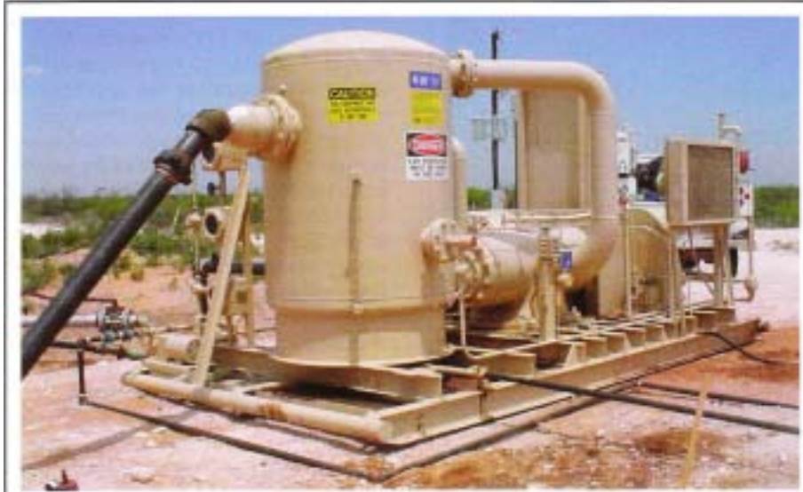
If multiple wells are located in close proximity, clusters of wells can often be linked to a single compressor package. The key is distance. Linking wells located far apart may save on compressor costs, but could cost much more in lost potential revenue by not pulling the farthest wells closer to 0 psi.

0 psi. When logistically feasible, a cluster of 10-20 wells can be linked to a single compressor package.