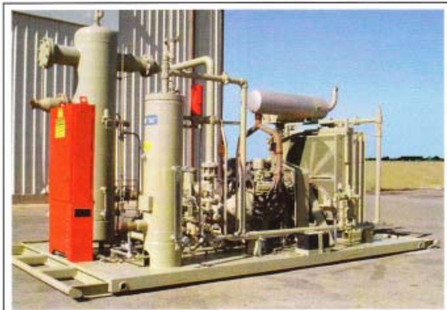
Casinghead gas is usually flash gas off the reservoir, which results in a relatively wet gas stream. Liquid handling equipment and compressor selection are critical in designing equipment packages for reducing casinghead pressure.

psi. The project resulted in increasing daily gas production by 79 Mcf (from 31 Mcf to 110 Mcf) and daily oil production by 96 barrels (from 21 to 117 barrels). As a result of reducing pressure by 24 psi, monthly revenues increased $155,850.